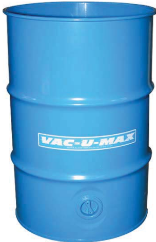
#23908 , 55-gallon open-top steel drum, 16-gauge, with 2" bung and blue powder coat finish.