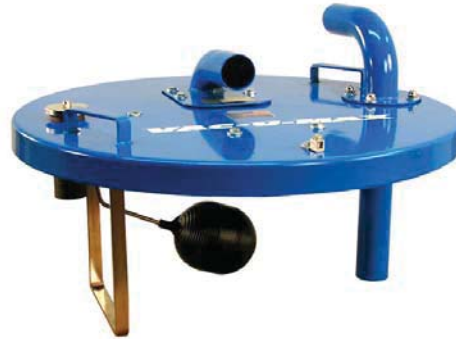
#55R-111 , Wet/Dry Intercept cover for 55-gallon open-top steel drum.