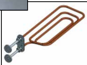
Copper Heat Exchanger