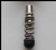
SPRING ASSEMBLY Impeller insert in 300 psi spring with Viton seat