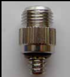
ANTI-DRIP BODY Bottom Housing with Viton O-Ring Thread (male) Standard - 10/24 Optional - 12/24