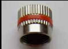
NOZZLE CAP Synthetic Mineral Orifice Insert w/ Viton O-ring